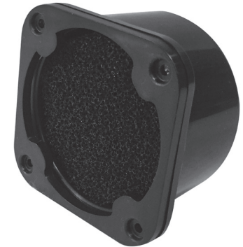
Figure 1. DM5 Microphone