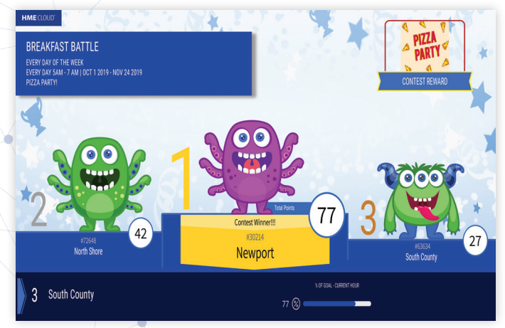
Contest winner with contest statistics.